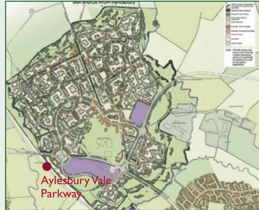
The proposed Berryfields development