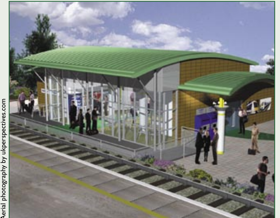
Computer generated image of proposed design for the new Aylesbury Vale Parkway station viewed from the new platform