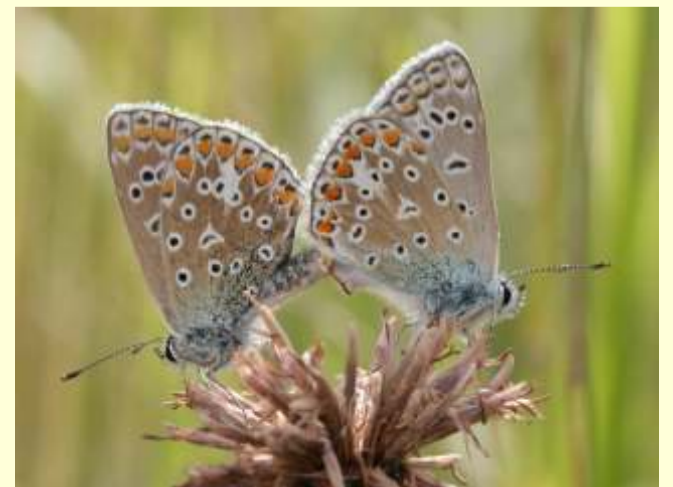
Common blue butterflies

Following the ancient chalk ridge used since prehistoric times, the 87 mile Ridgeway offers the opportunity to escape the hustle and bustle of everyday life, www.nationaltrail.co.uk tel 01865 810224