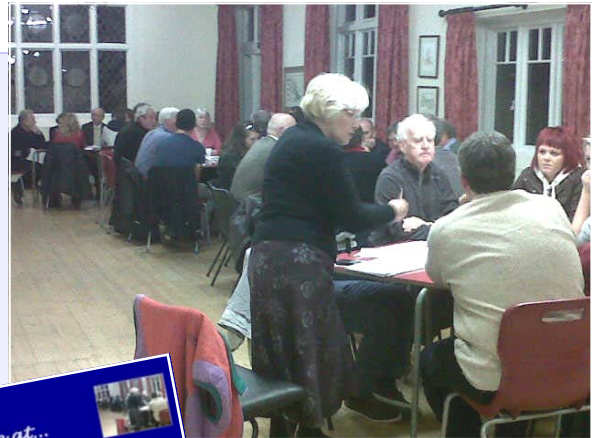
Above: The Wendover Local Area Forum's priorities refresh workshop held in October

Wendover Decides, a project giving local people a say in how they would allocate £10,000 of the Local Area Forum's local priorities money, ran from late November to end December 2011 following approval by Local Area Forum members in October.