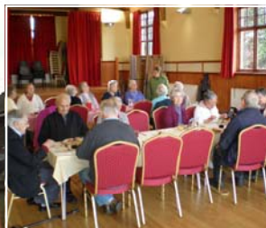
Far left: Local residents making use of the Wendover Community Carto get to Wendover market