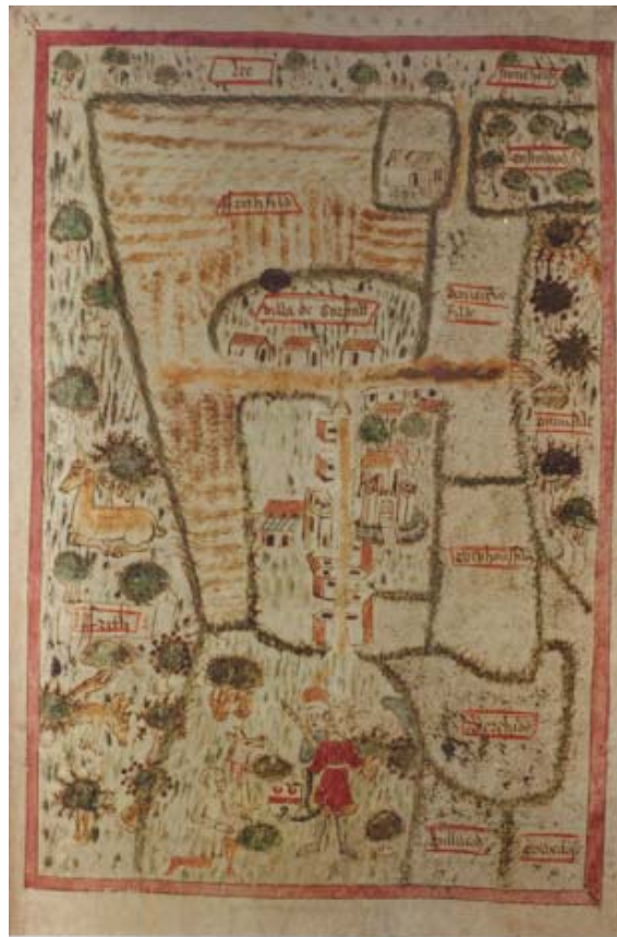
Map of Boarstall, from the Boarstall Cartulary