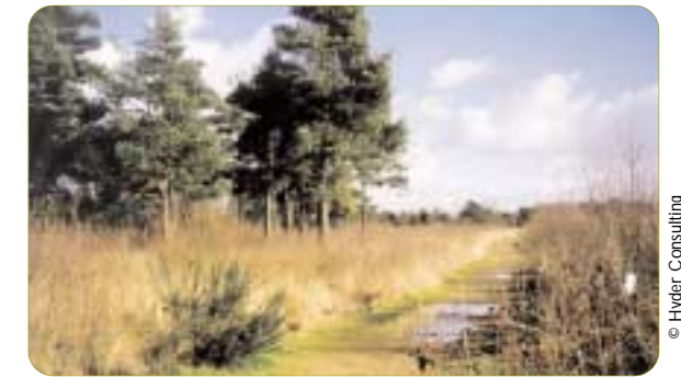
Stoke Common - a heathland remnant and SSSI

Z13.4 A narrow band south of Stoke Poges and the Farnhams close to the edge of Slough has less woodland, several golf courses, the Slough Arm of the Grand Union Canal and, in places, an urban fringe character. Fields are generally small with high unmanaged hedgerows, many with extensive elm regeneration. There are also commercial orchards, soft fruit and market gardening.