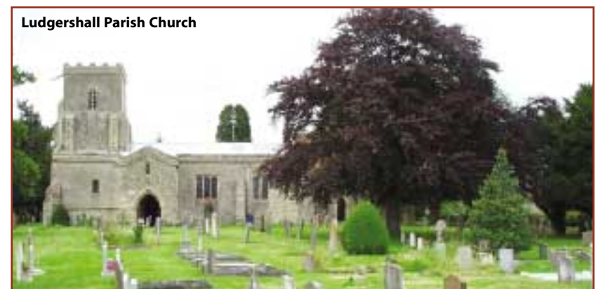
Ludgershall Parish Church

After turning off the loop near Ludgershall, the link route approaches the very busy A41 main road and particular care must be taken when crossing here ▲. Peace then returns and the route passes through the village of Grendon Underwood in whose lovely old inn William Shakespeare is reputed to have stayed regularly, basing some of the characters in his plays on local people. Business traffic from the Springhill Prison makes for busy roads again for a mile or two, then tranquillity returns once again as the link joins up with the Bicester/Buckingham loop at a crossroads where care should be taken ▲.