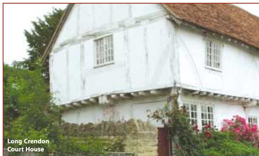
Long Crendon Court House

Heading north from Long Crendon, the road continues to rise to Chilton . On the way there is a minor road turning to the right, which provides a shorter ride, taking the