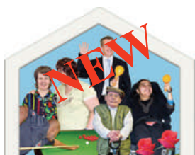
Day Opportunity Centres

In Buckingham, we are trying to find the best way to use the current site. We will soon be talking to the Town Council about what happens next.