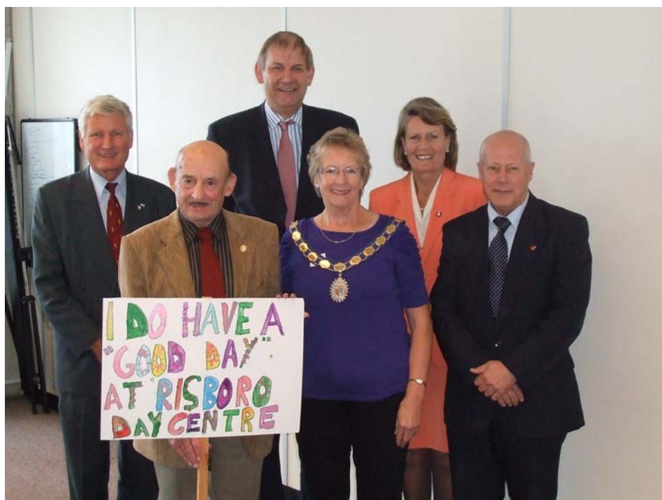
(Princes Risborough gets the go ahead at Cabinet, 19 th September)

Last month the Council agreed that the Princes Risborough building could be taken over by a Social Enterprise company who will run services from the building for the whole community. The Council will lease the building for a very low rent to the Social Enterprise company for up to two years so that the company has time to raise the funds to purchase it. This is a very good example of 'Big Society' in action.